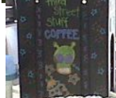
Coffee from Third Street Stuff kept participants sustained!