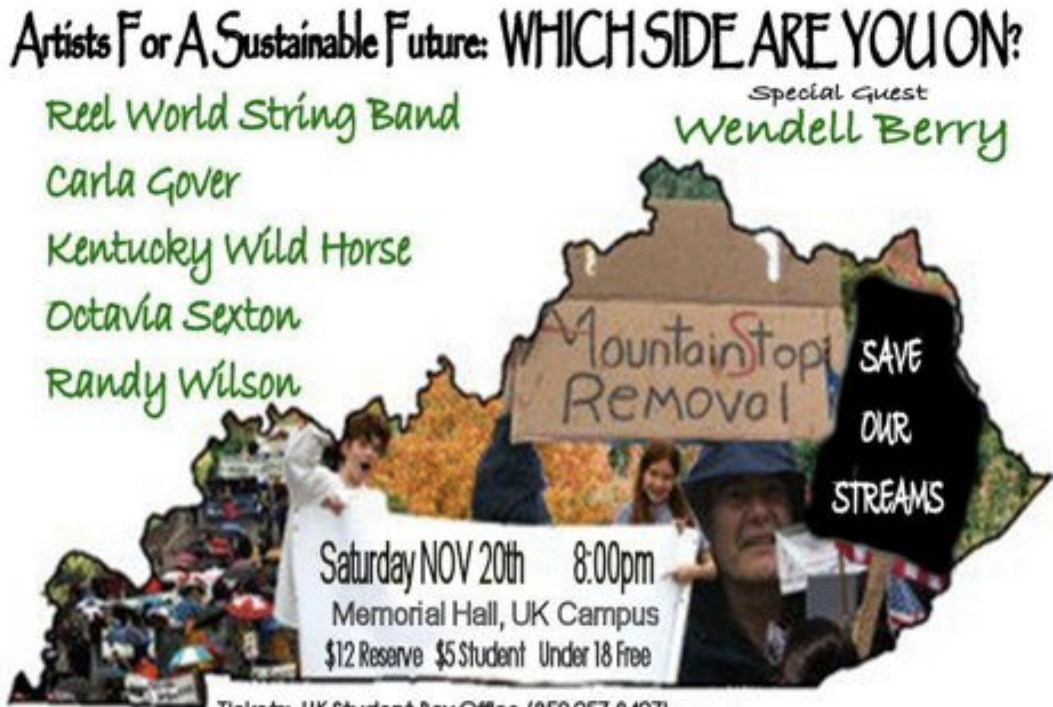
Tickets: UK Student Box Office (859 257-8427)